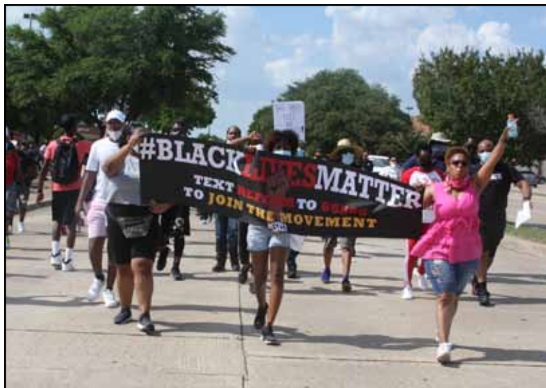
More than 100 participants braved the Texas heat to bring a nationwide outcry over police treatment of minorities to the local stage in DeSoto.

The protestors observed the death of George Floyd, the most recent black man who was allegedly killed beneath the knee of a Minneapolis police officer and extended the focus to also raise awareness of the 22 black women killed by law enforcement officers. The #SayHerName protest was held one day after what would have been the now deceased Breonna Taylor's 27th birthday. Taylor, a 26-year-old EMT who was killed by police officers in her own home in Kentucky in March, is the most recent black woman killed by