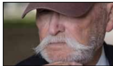
Judge Joe Spurlock II